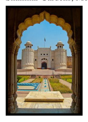
Shalimar Gardens, Lahore

Pakistan 's city of Lahore is fantastically rich in history because of Badshahi Mosque, Shalimar Gardens, Moghul tombs and other Moghul historic sites.