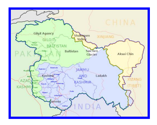
Disputed Jammu and Kashmir Territory**

The issue of Kashmir as a disputed territory was created in 1947 when the British left the subcontinent. This has caused much conflict in the area. India. Pakistan and China all claim parts of the state of Jammu and Kashmir.