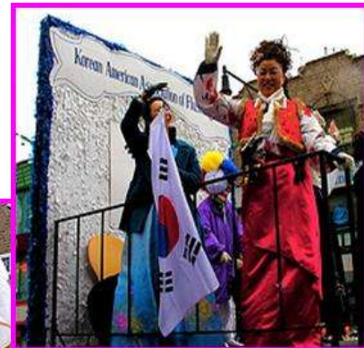
Korean Lunar New Year Parade in Flushing, Queens

For more information on Korean holidays, you may visit the following websites: