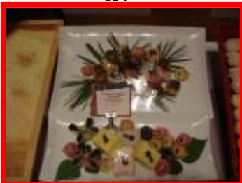
Half Moon Shaped Rice Cakes