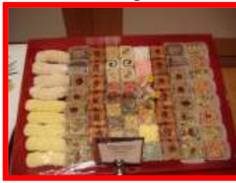
Traditional Korean Confectionary