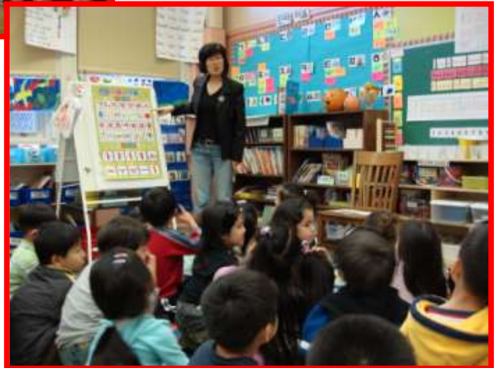
Students are learning Korean in PS 32's kindergarten dual language class.

Dual language programs are bilingual programs that provide half of the instruction in English and half of the instruction in the native language of the ELLS participating in the program. Students become bicultural and fluent in both languages.