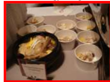
Ginseng Chicken Soup