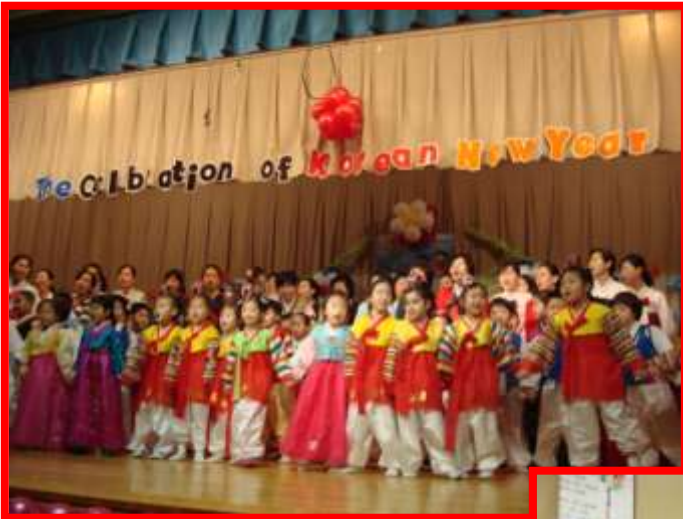
Students, parents and staff celebrate the Korean New Year at PS 32.

PS 32, located in Flushing, Queens, is the site of a Korean-English Dual Language Program. The program started in 2005 with one kindergarten dual language class. Currently the program has expanded through the fourth grade, with one dual language class at each grade level.