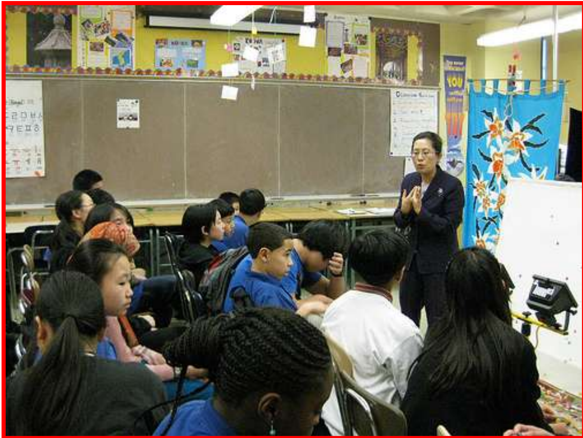
A Korean language class at the East West School of International Studies

The East West School of International Studies prepares students for professional careers in an international world by providing a firm academic foundation and a thorough understanding of the Asian world. An important part of their education and preparation includes the study of Chinese, Japanese or Korean. Students become proficient in the language and thoroughly knowledgeable about the cultures and customs related to the language that they have chosen to study.