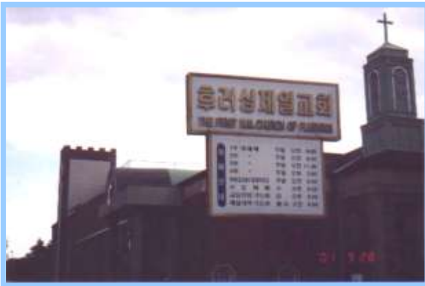
Christian Church – Flushing, Queens