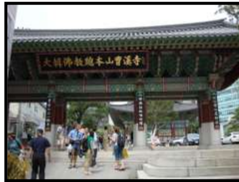
Buddhist Temple - Seoul, Korea

Note to Teachers: The religions practiced in Korea include Buddhism, Confucianism and Christianity. Most Korean immigrants living in New York practice Christianity.