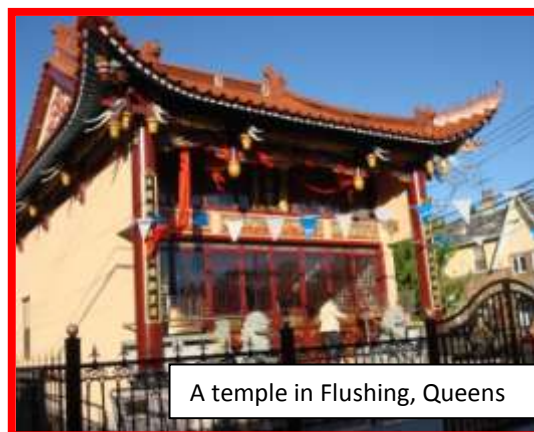
A temple in Flushing, Queens