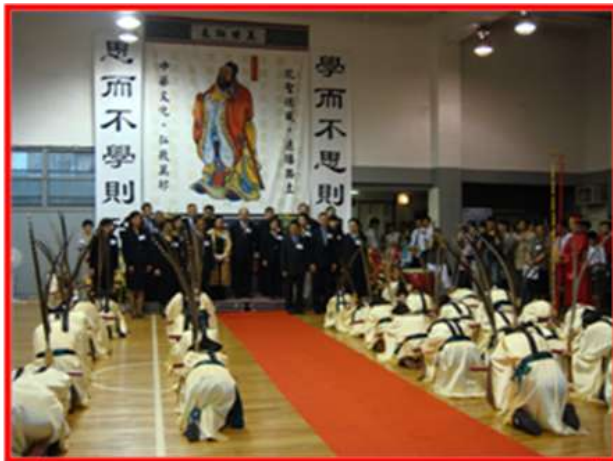
A ceremony to pay respect to Confucius is conducted in the Chinese Consolidated Benevolent Association in New York City Chinatown.

Confucius (551-479 BC) is considered the greatest sage and teacher (至圣先师) in the Chinese