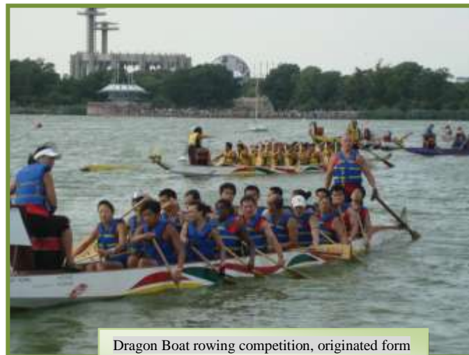
Dragon Boat rowing competition, originated from a popular activity on Dragon Boat Festival is now a big annual event in Queens, New York.